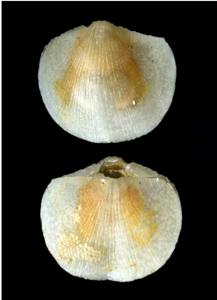
Figura 13: Megerlia truncata (Linnaeus, 1767) Nord Sardegna - mm15x12

(= M. echinata ; M. monstruosa ; M. gigantea ; = Pantellaria monstruosa )