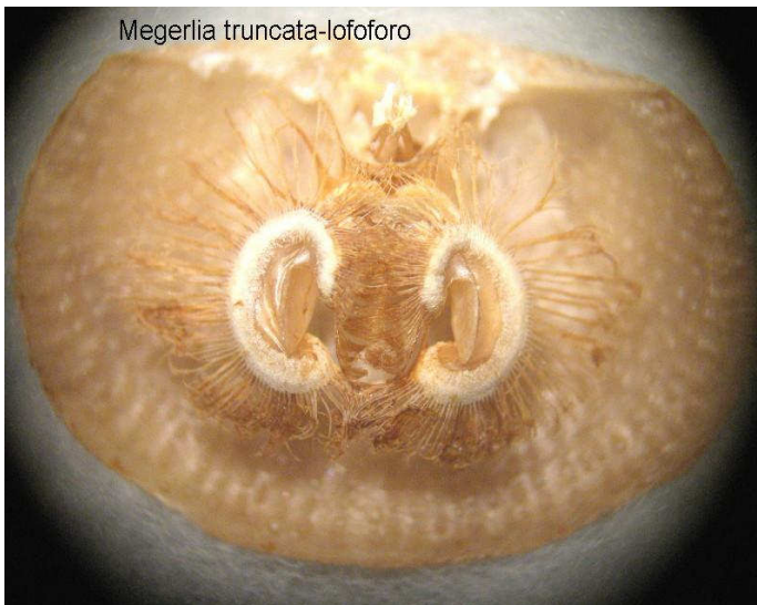
Figura 14: http://www.naturamediterraneo.com/forum/topic.asp?TOPIC_ID=130062