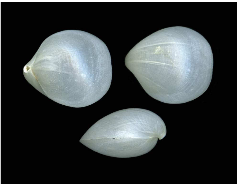
Figura 2: Gryphus vitreus (Born, 1778) Località: Nord sardegna