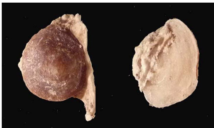
Figura 1: Neocrania anomala , Skyros -60-80 m

http://www.naturamediterraneo.com/forum/topic.asp?TOPIC_ID=130076